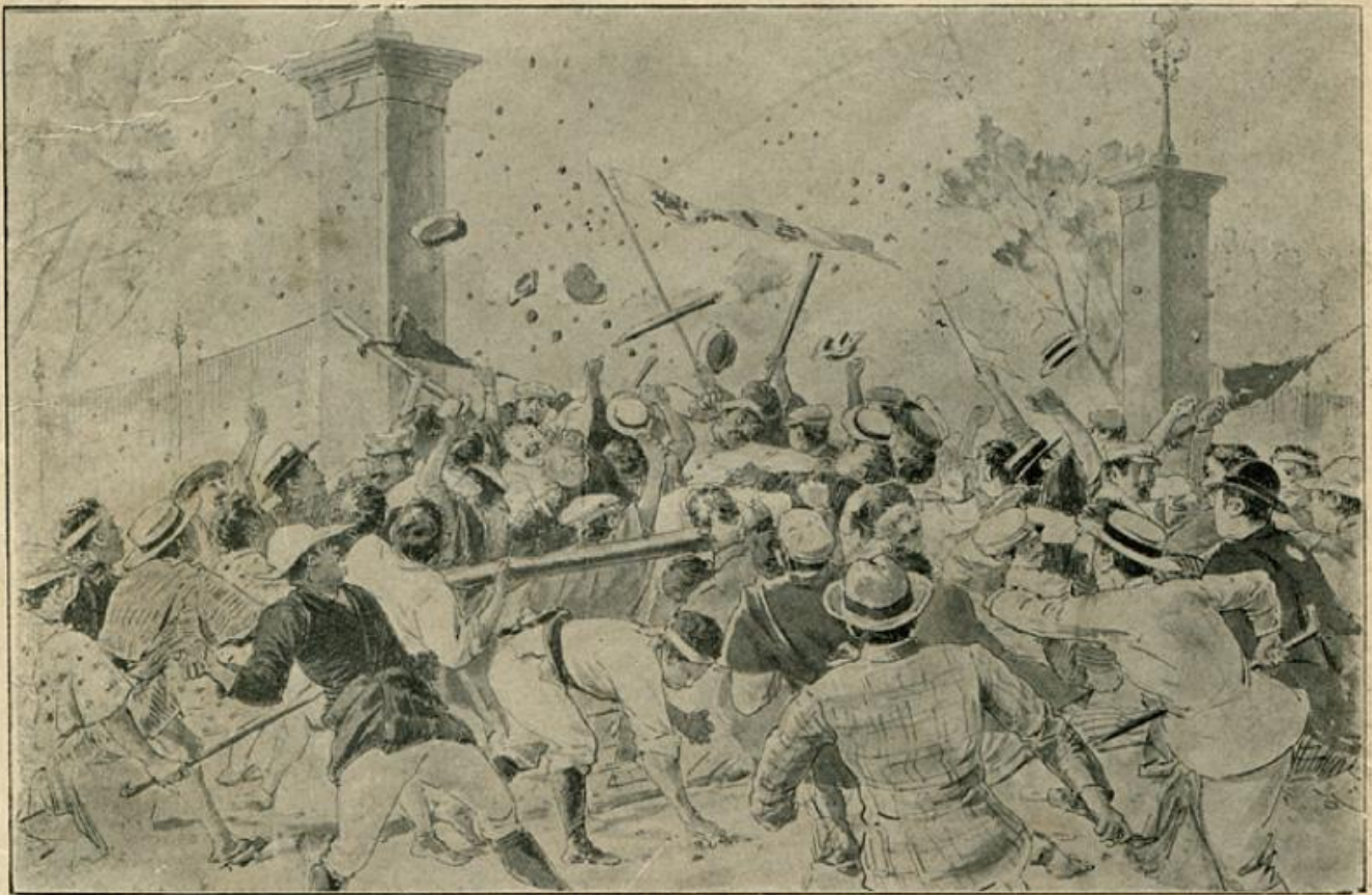
The Great Disturbances in Tokyo: The upper picture—Mr. Kōno, ex-president of the House of Representatives, speaking at the anti-peace mass meeting of Tokyo citizens. The lower picture—riotous scene which followed in consequence of the attempt of the police to prevent the ingress of the crowd into Hibiya Park.